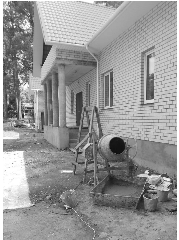
Nothing says "renewal" like the all-season camp, conference, and educational facility of the Smolensk Baptist Church. Construction continues through 2011.

When 2011 ends, the PC(USA) will have three General Assembly-appointed mission co-workers (Ellen and Al Smith, based in Berlin, and myself) and three congregationally commissioned mission workers dedicated to ministry with partners in Russia. In the months ahead we will remain open to new opportunities to engage in mission with our